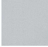
Sparkling Silver - 01